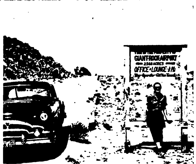
2. Gateway to Giant Rock Airport.