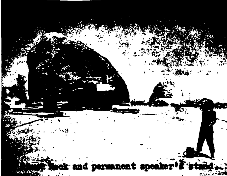
Giant Rock and permanent speaker's stand.