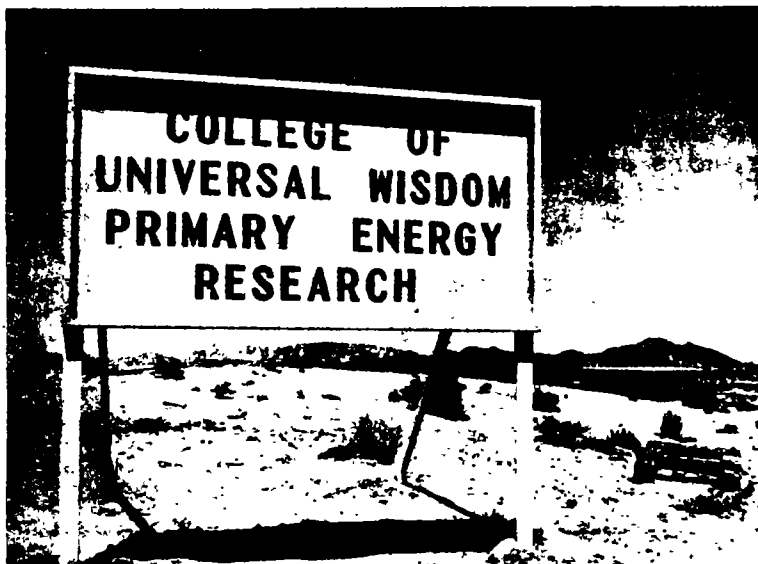
College of Universal Wisdom Building