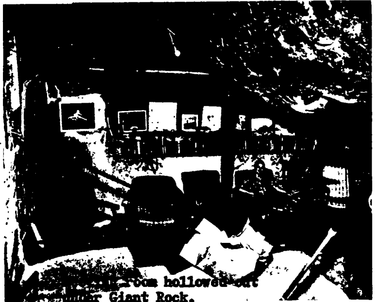
Room hollowed out under Giant Rock.