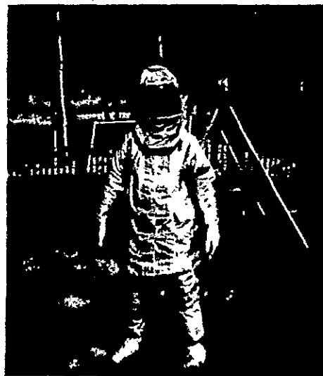
Similar disguise photograph taken under better lighting conditions.